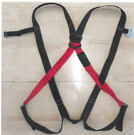
A000-1000 - BLACK KITE

Product designation: A000 Commercial trade name: COFRA Intended purpose: Protection of falls from a height when used on personal fall arrest systems. Model: A000 Reference code / Variants: A000-1000 - BLACK KITE (equipped with dorsal attachment point only) A000-1001 - CERBERO (equipped with dorsal and sternal attachment points) In Conformity with the Standard(s): EN 361:2002 and / PPE Category: III Webbing material(s): Polyester Webbing width (mm): Base webbing: 45 mm; Sternal adjustment webbing: 30 mm Number of adjustment elements: 2 Material of the adjustment elements: Galvanized steel Number of attachment points: A000-1000: 1 (dorsal) A000-1001: 2 (dorsal and sternal) Material of the attachment points: Textile sternal attachment point (only variant "A000-1001"): Polyester; Metallic dorsal attachment point: Galvanized steel Material of the stitching: Polyester HT Sizes: One only adjustable: M-2XL Weight (g): A000-1000: 750 grams; A000-1001: 818 grams Manufacturer's name: COFRA S.r.l. Manufacturer's address: Via dell'Euro 53-57-59 - 76121 BARLETTA (BT) - Italy Authorised Representative's name: / Authorised Representative's address: / Certificate's holder: COFRA S.r.l. Holder's address: Via dell'Euro 53-57-59 - 76121 BARLETTA (BT) - Italy