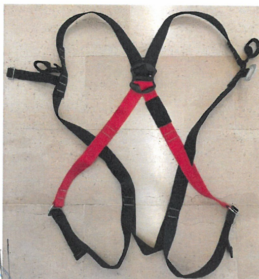
A000-1001 - CERBERO